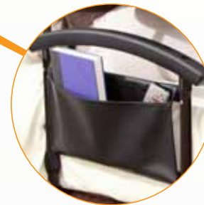
Includes Organizer Pouch Incluye Bolsillo Organizador