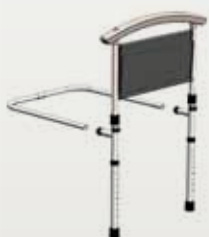
Attach Base Tubes into the Base Support Tubes. Make Sure the Spring Pins Engage.