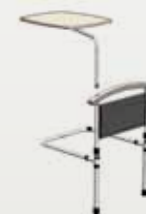
The Height of the Tray Can Be Adjusted by Removing the Tray Pivot Tube From the Handle. Adjust the Clip Pins by Removing them and Reinserting the Clip Pins in the Holes Located in the Handle Upright Tubes.