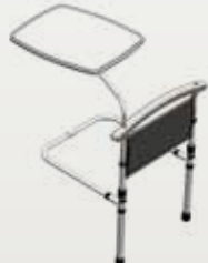
Insert the Tray Pivot Tube into One of the Desired Tray Pivot Tube Receiver Holes Located on Top of the Handle.