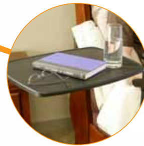
Tray Swivels Out of the Way La Bandeja se Aparta Hacia Afuera

La Barra Ergonómica Lo Ayuda a Meterse y a Salir de la Cama